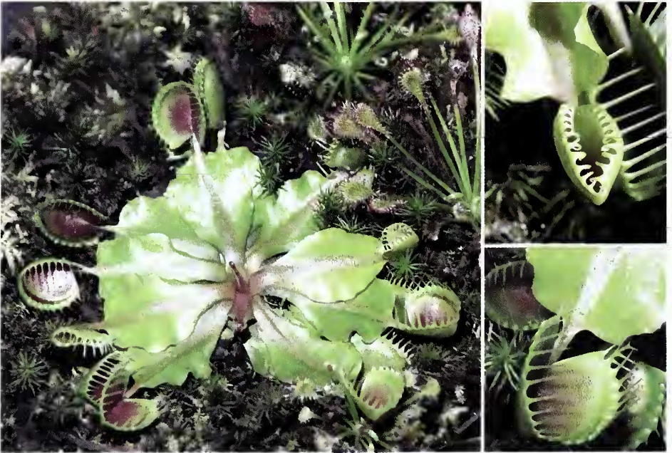
Figure 5: Dionaea muscipula 'Cupped Trap'. Left: plant in cultivation; top right: developing trap with circinate marginal spines; bottom right: closer view of mutated trap.